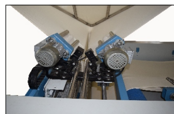
Edge Curling Remove Coil Roll Unit

The Offered Machine Is Suitable For Stitching Specially Knitted Fabrics, Spandex, Lycra And Shearing Fabrics Which Need Folding And Stitching Before Dyeing Process After Pre-setting. Our Offered Machine Is Precisely Engineered Using Premium Grade Components And Ultra-modern Techniques At Our Vendor's End.