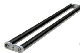
WEB-GUIDE SENSOR 2800 MM