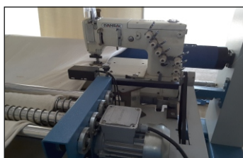
Stitching Machine (Kansai-Japan)