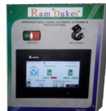
Colour LCD Feather Touch Screen