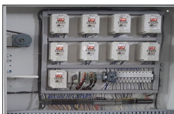
Electrical Panel Board With PLC